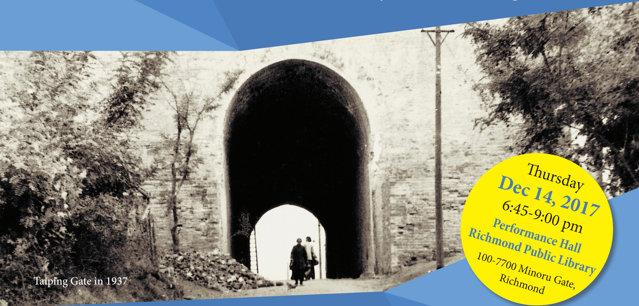
Taiping Gate in 1937

Thursday Dec 14, 2017 6:45-9:00 pm Performance Hall Richmond Public Library 100-7700 Minoru Gate, Richmond